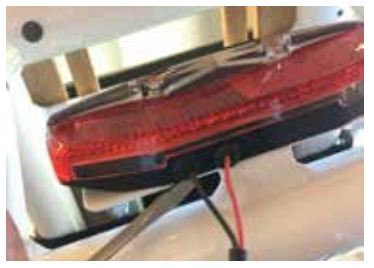
Remove wires from plugs